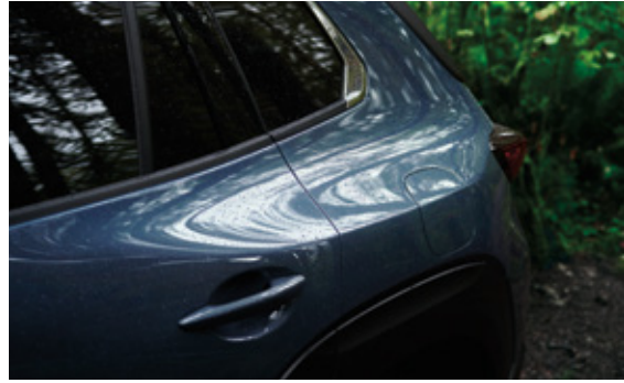
Polymetal Gray Metallic