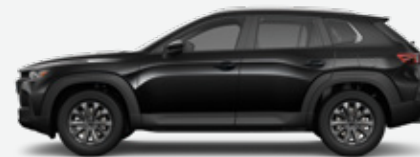
CX-50 2.5 S

Rear seatbacks folded down: 56.3 cubic feet