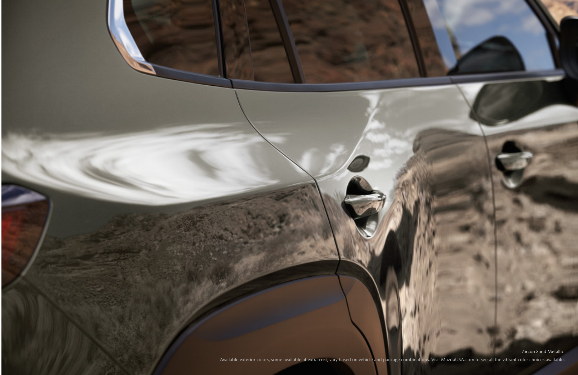
Zircon Sand Metallic

Additionally, it was important to us that even the color of the CX-5 heightens your connection with nature. So, we created a new color specifically for this reason. The available Zircon Sand Metallic summons notions of venturing down rustic primitive trails far from the beaten path.