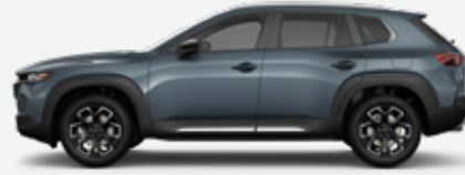
CX-50 2.5 TURBO MERIDIAN EDITION