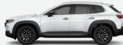
CX-50 2.5 S PREMIUM