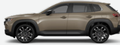
CX-50 2.5 TURBO PREMIUM