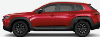
CX-50 2.5 S PREFERRED PLUS