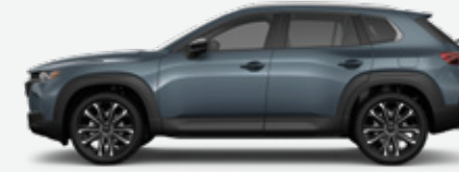
CX-50 2.5 TURBO PREMIUM PLUS