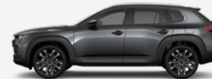
CX-50 2.5 S PREMIUM PLUS