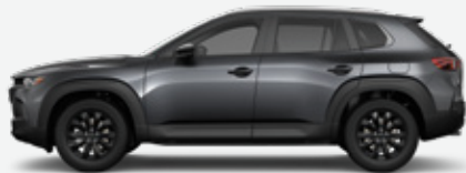
CX-50 2.5 S PREFERRED