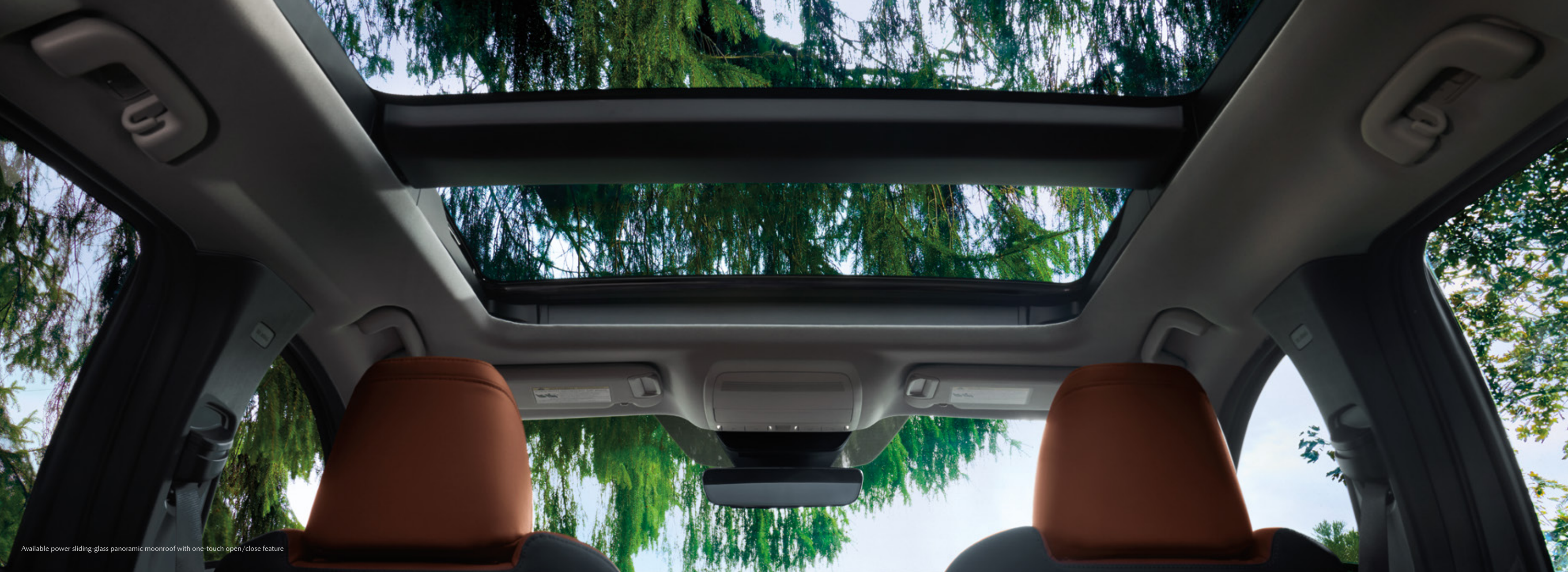
Available power sliding-glass panoramic moonroof with one-touch open/close feature