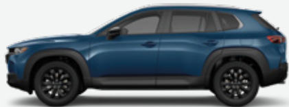
CX-50 2.5 S SELECT